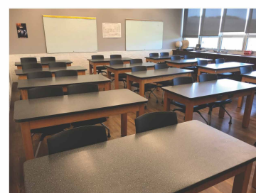
science lab *one student per table